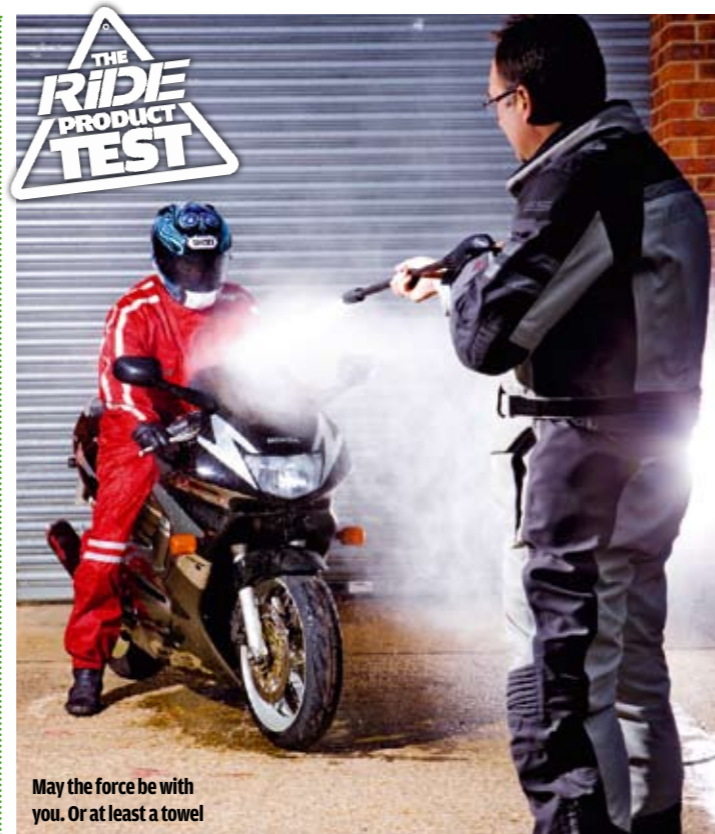
May the force be with you. Or at least a towel

The harshest but most important test of all: a five-minute soaking from a pressure washer. Underneath each test suit, our tester wore full bike kit with a light-grey absorbent base layer between the suit and kit to pick up any leaks. And she sat on a bike. After the drenching, each suit was carefully removed and the under layer was checked for leakage. While this test does not replicate a long ride in torrential rain, it is a good simulation of a downpour, and sorts out the best from the rest.